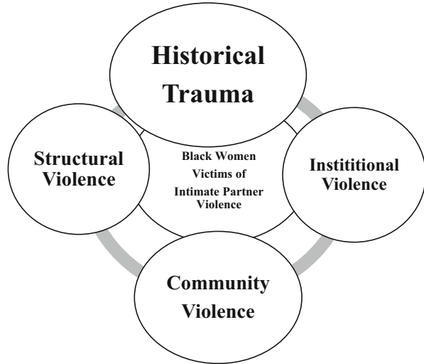
Fig. 2 Black women's intimate partner violence in the context of multiple forms of violence